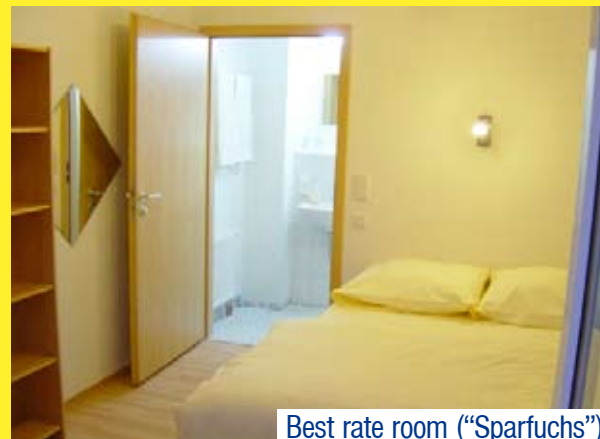
Best rate room (“Sparfuchs”)